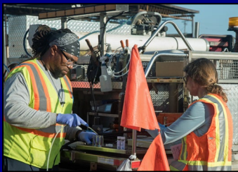
Field technicians conduct groundwater sampling of an environmental cleanup site at Naval Weapons Station Seal Beach.