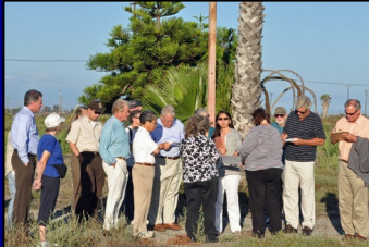
RAB members listen to a field update provided by Navy staff during a tour of installation environmental cleanup sites.

Naval Weapons Station Seal Beach 800 Seal Beach Boulevard Seal Beach, CA 90740 (562) 626-7215